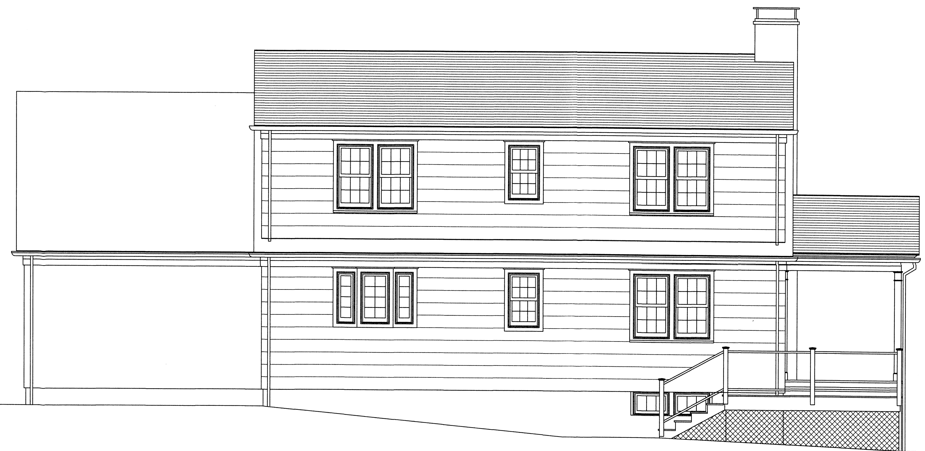
3 ELEVATION - REAR EXISTING SCALE = 1/4" = 1'-0"