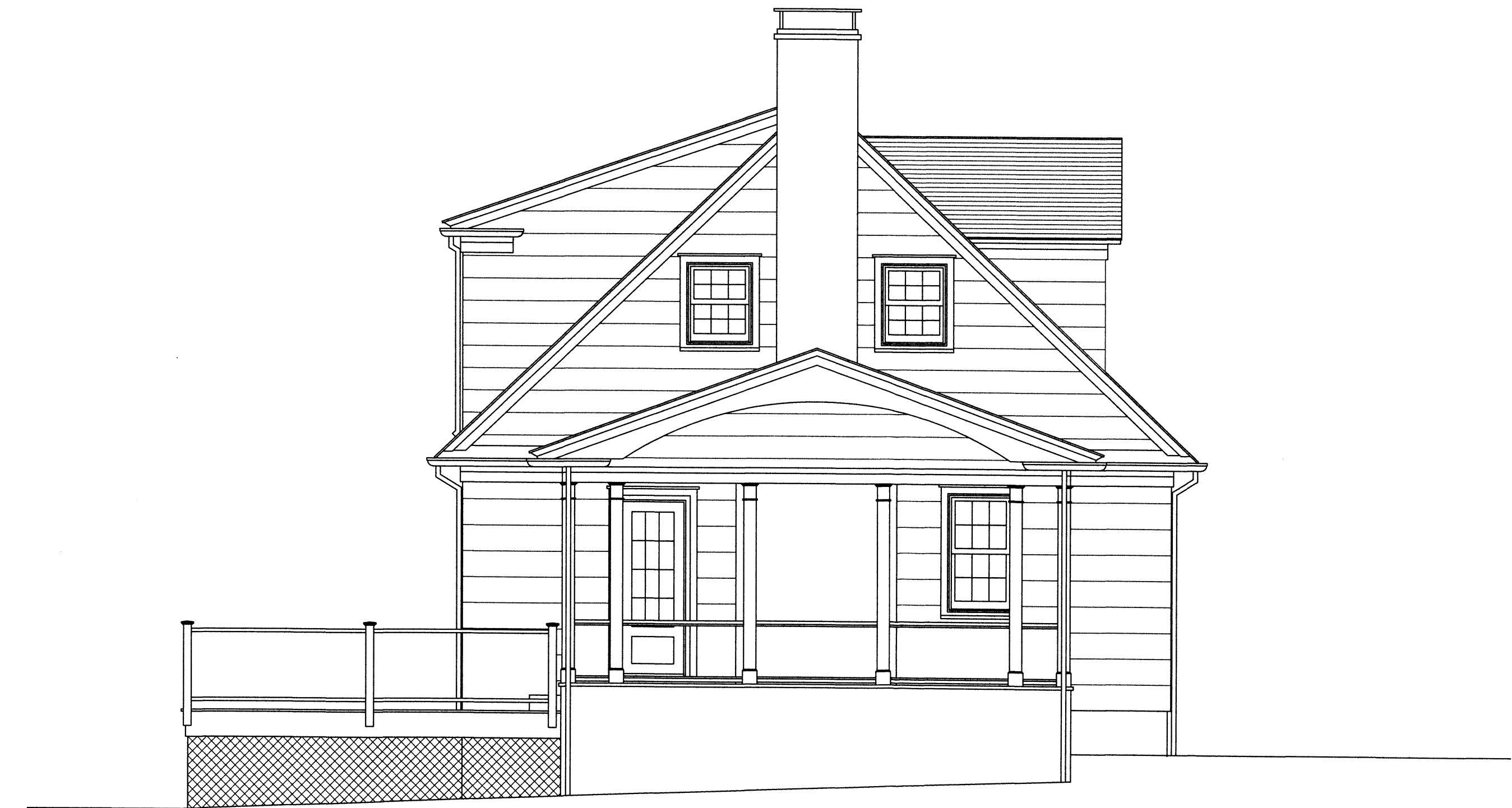
2 ELEVATION - SIDE EXISTING SCALE = 1/4" = 1'-0"