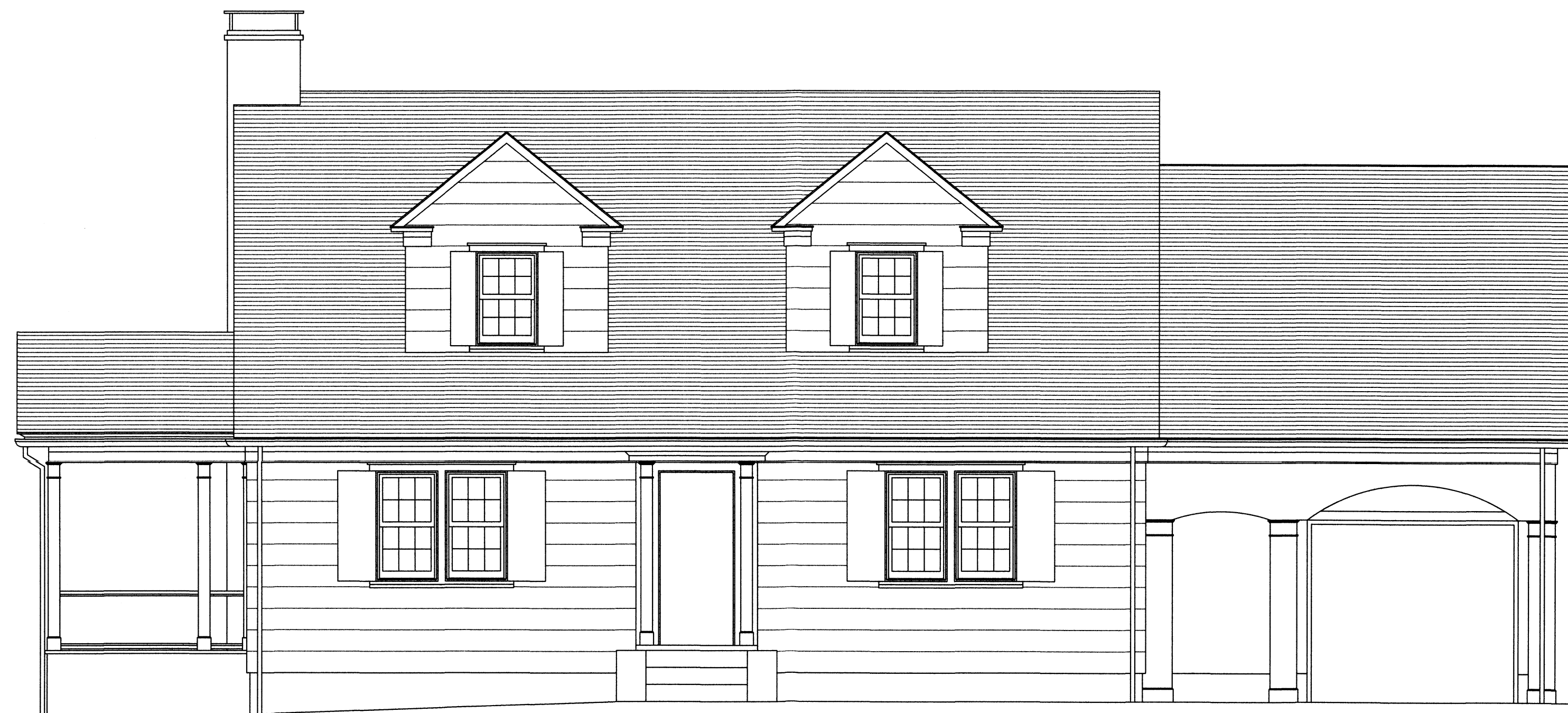
1 ELEVATION - FRONT EXISTING SCALE = 1/4" = 1'-0"