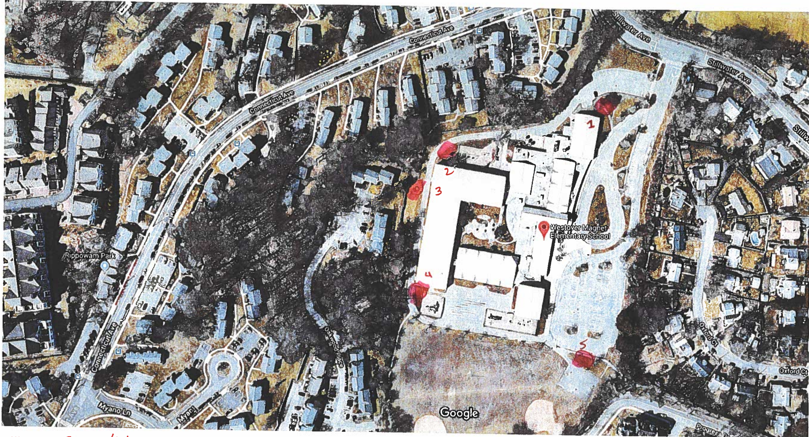
Imagery ©2019 Google, Map data ©2019 Google 100 ft