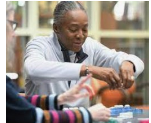
Stamford Advocate Mah-Jongg at the library