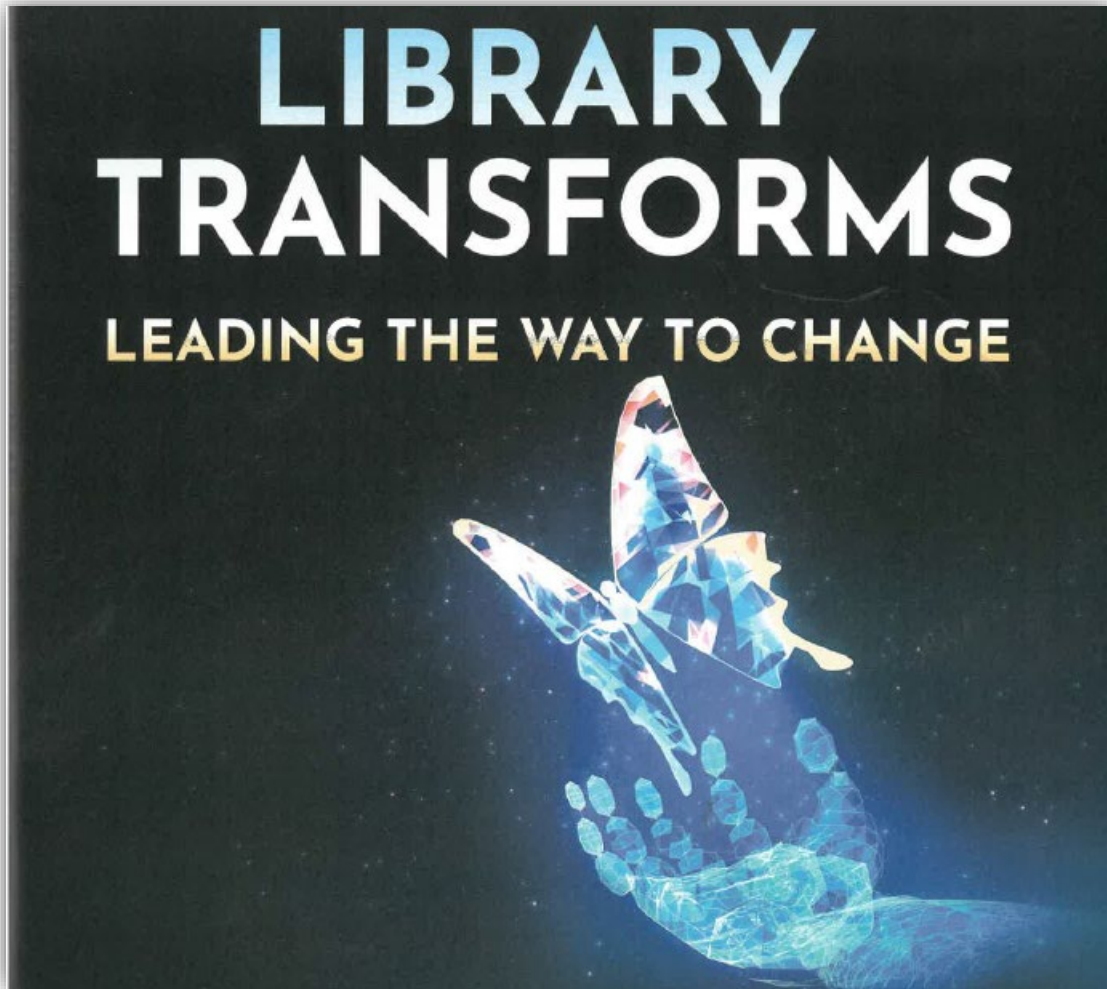
Our 2021-2022 Annual Report

The library is not only a sanctuary for banned books, but a sanctuary for our users who have few safe spaces in their lives.