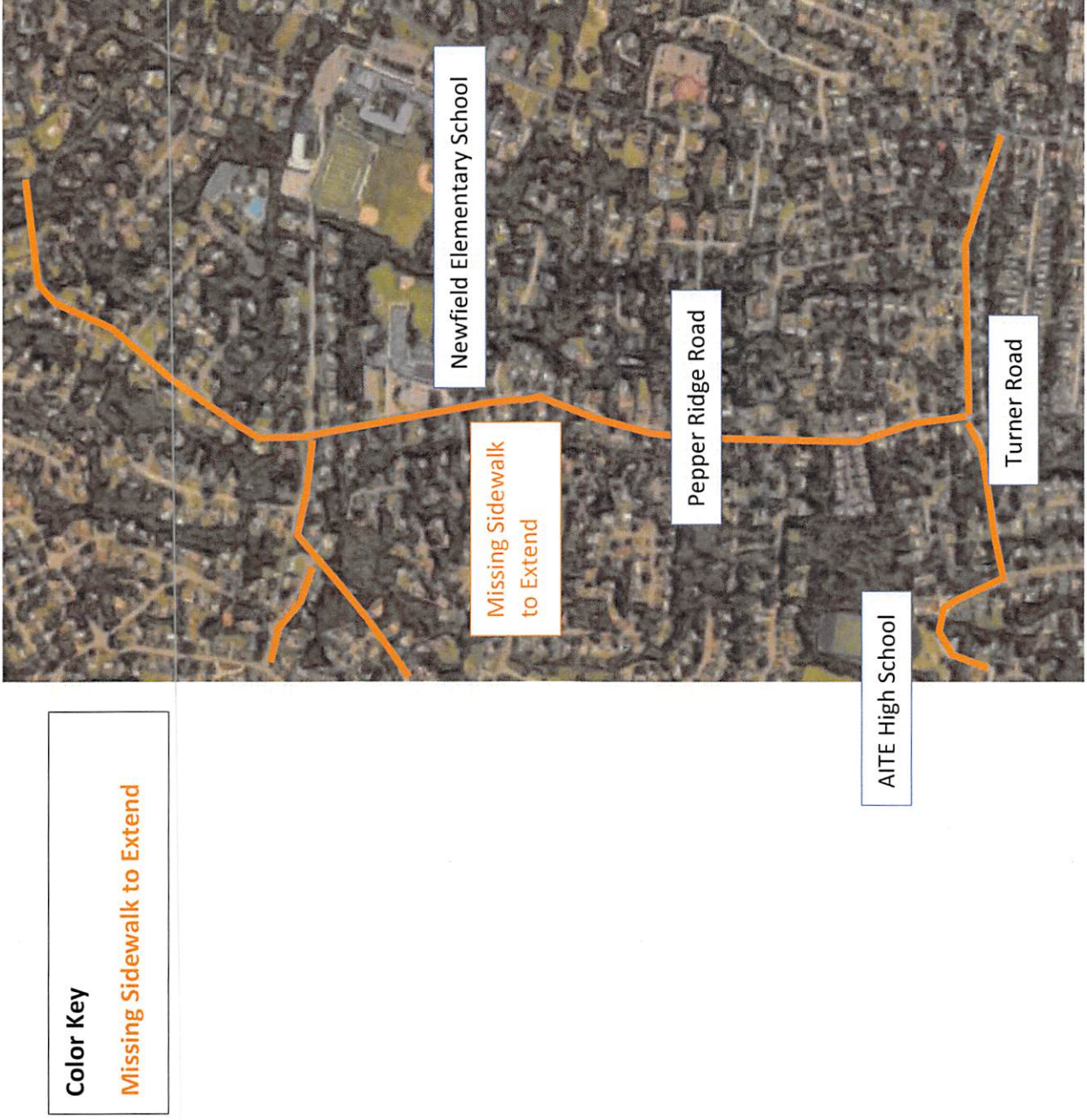
Figure 3: Newfield Elementary and AITE High School Pedestrian Access Improvements Concept Plan