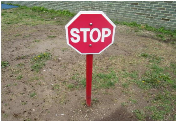
Stop Sign BCI Burke